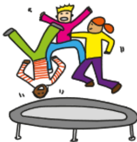
Rough and Tumble Play