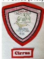
1 st . Cirrus (9452)