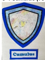
3 rd . Cumulus (7312)