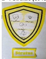
2 nd . Stratus (8948)