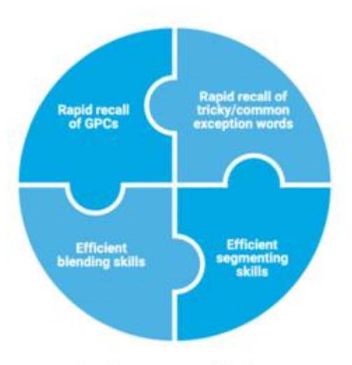
Four Cornerstones of Phonics

ensure that the four cornerstones of phonics are covered. During our phonics lessons, children will repeat the elements from the four cornerstones of phonics to ensure that they have rapid and automatic recall of GPCs (Grapheme Phoneme Correspondence and tricky/common exception words; each day, they will experience blending and segmenting activities to allow regular practice of these core skills.